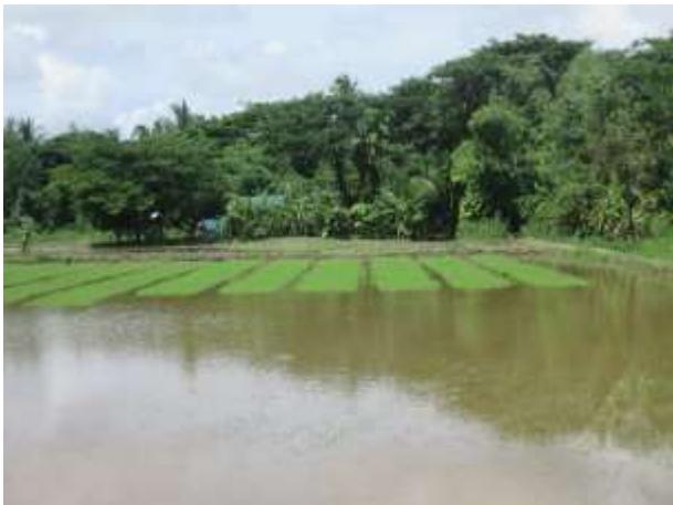
Nursery with raised bed but problem of water management