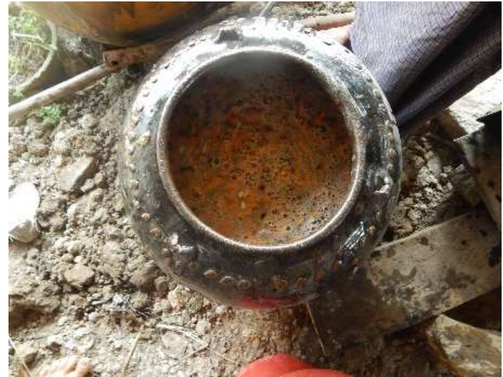
IEM solution before fermentation