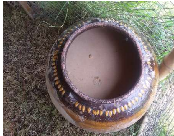
IEM ready to use after 45 days