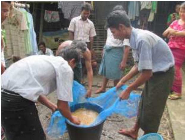
Seed selection with salty water