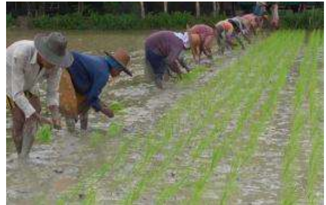
Main field with 1 seedling per hole transplanted in line