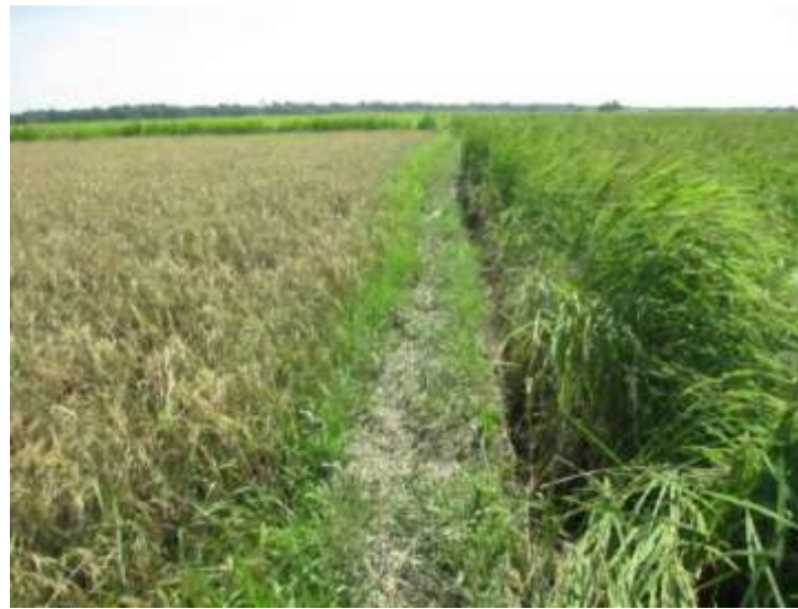
Paddy without jute before (left) after jute (right)