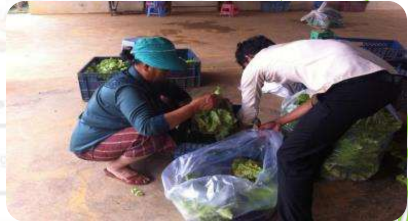
10. Sale preparation