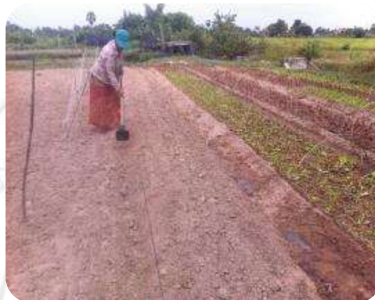
2. Line preparation