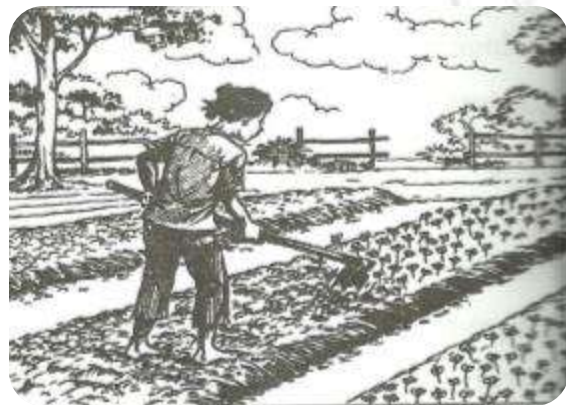
4. Manual plough