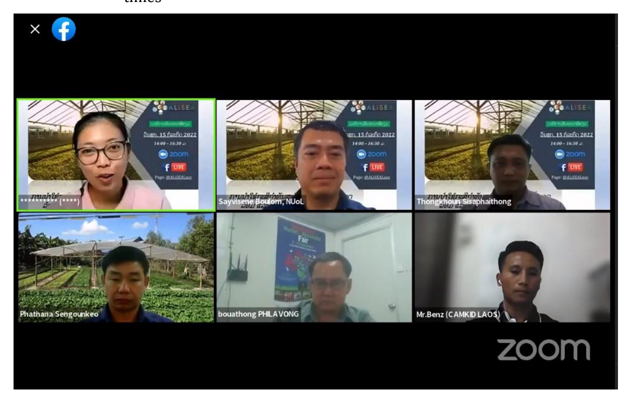
<u>Picture 5</u>: Example of a live stream from Zoom to Facebook Live