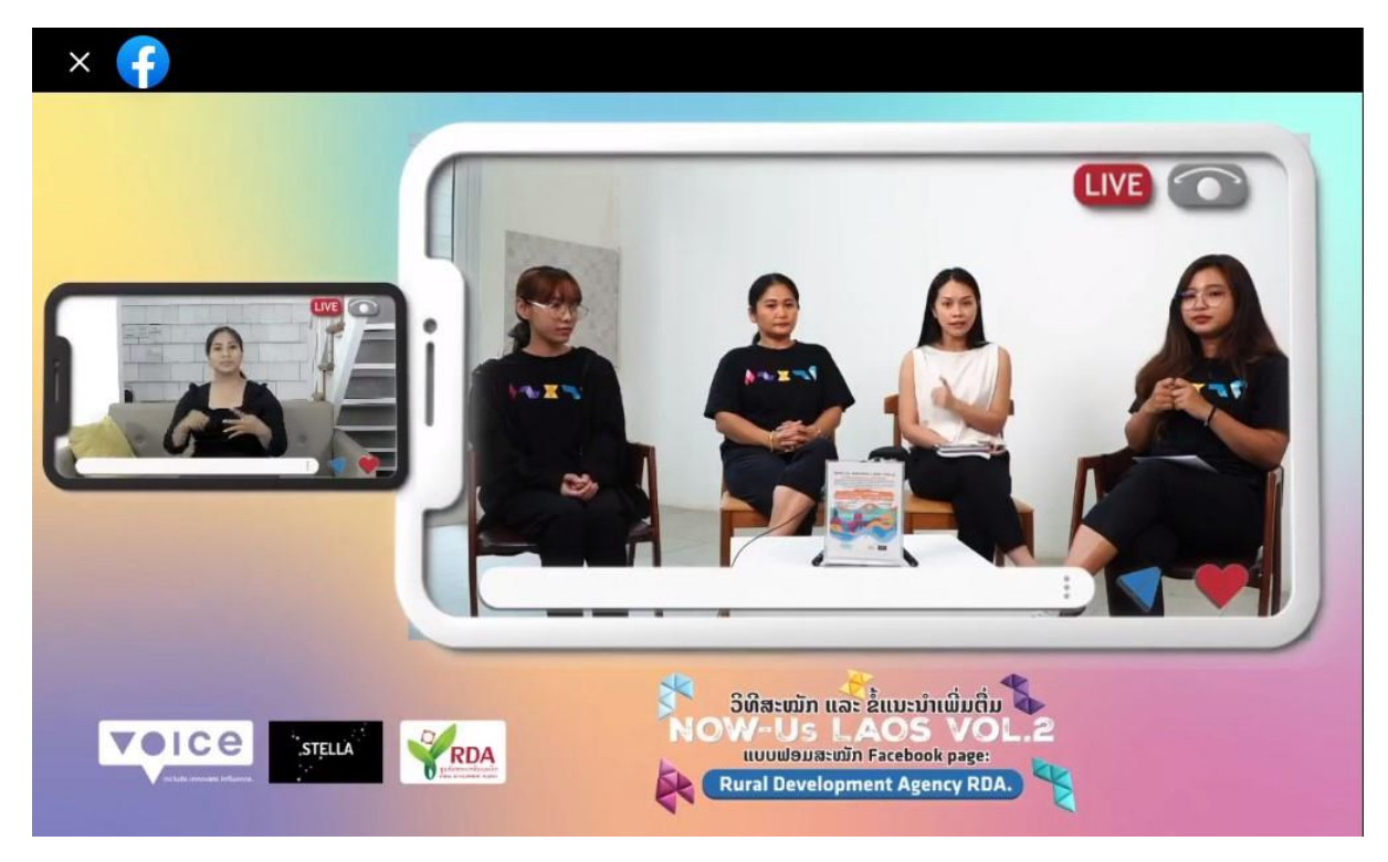
<u>Picture 7</u>: Example of a live stream from Facebook Live streaming through the OBS studio program