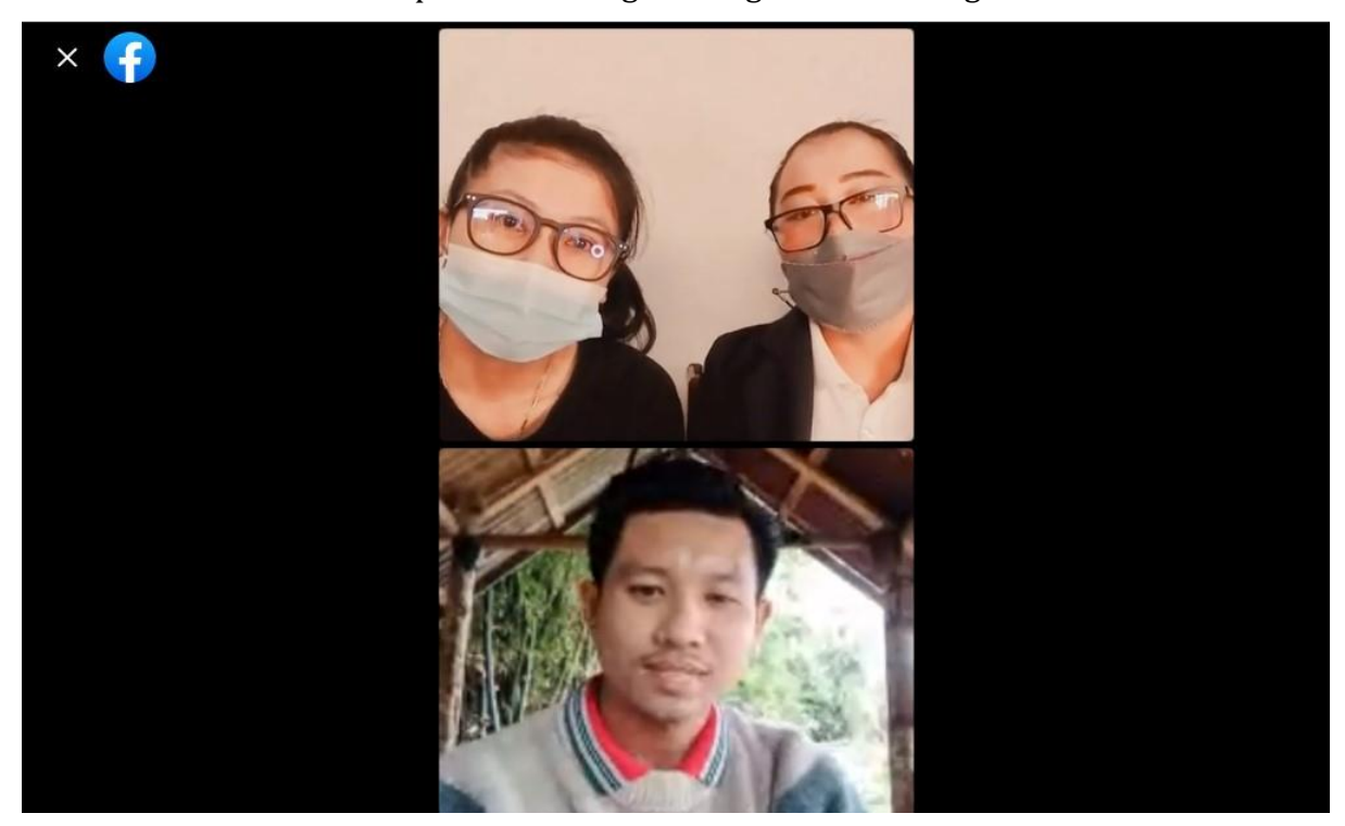
Picture 6: Example of a live stream from through the Facebook Live app